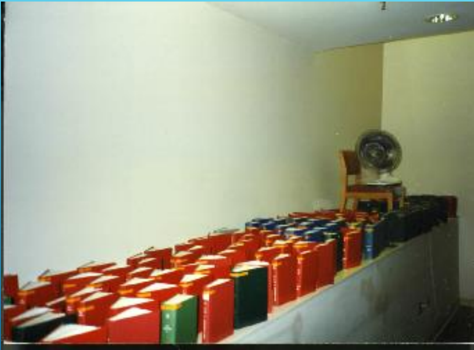
▶ 1995 - Books with fanned pages drying